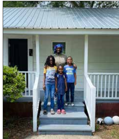
McQueen Street home dedication will be held at 4 p.m. Saturday, May 11.